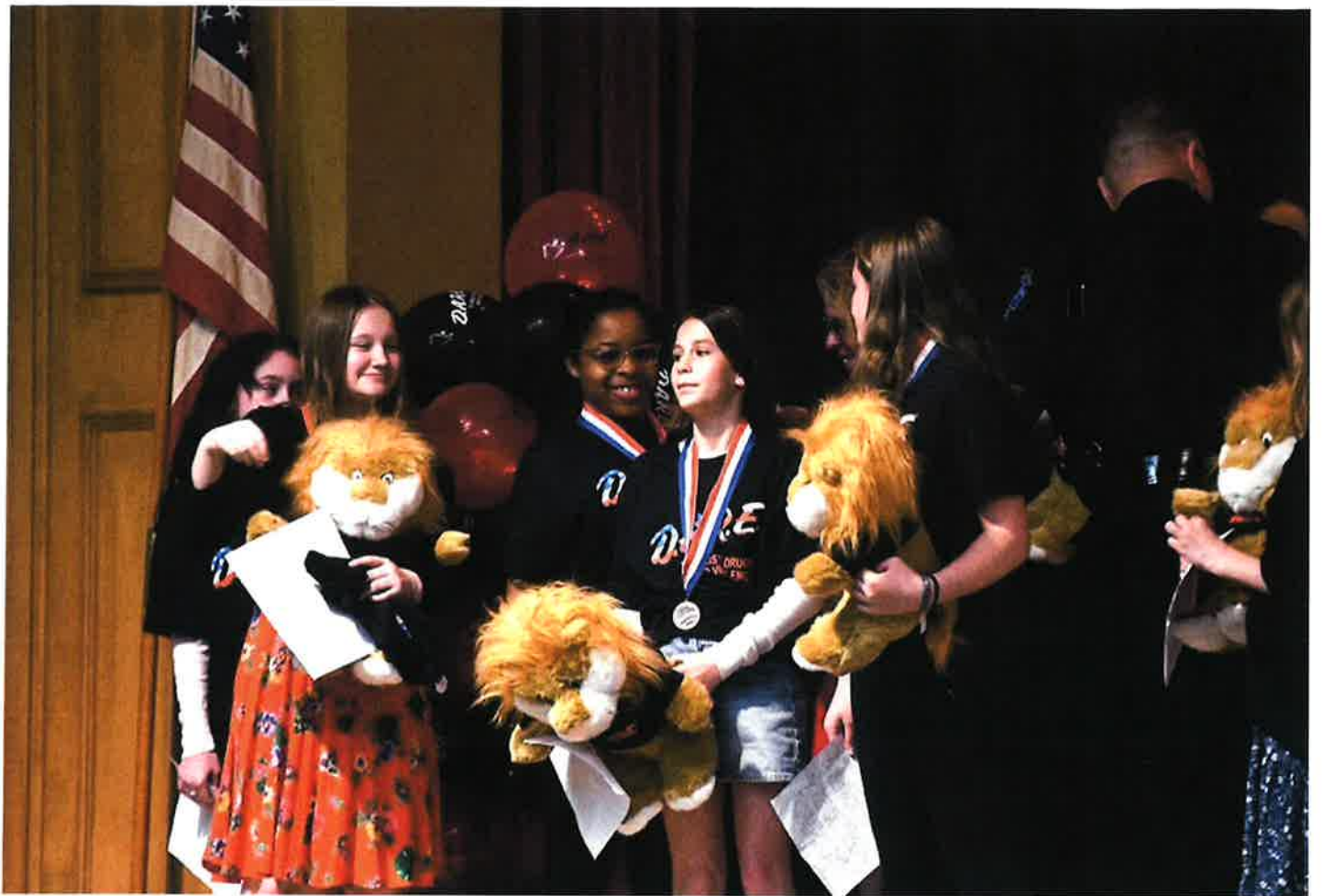
Student essay winners are awarded stuffed D.A.R.E. mascots and medals during the ceremony.